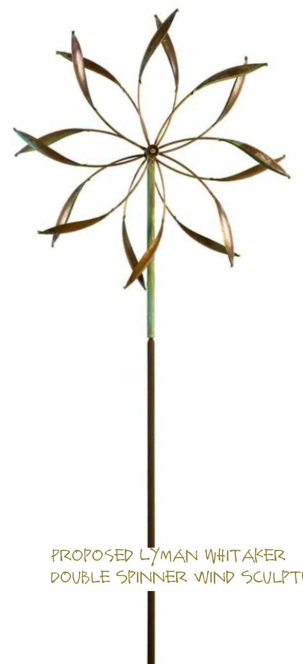
PROPOSED LYMAN WHITAKER DOUBLE SPINNER WIND SCULPTURE